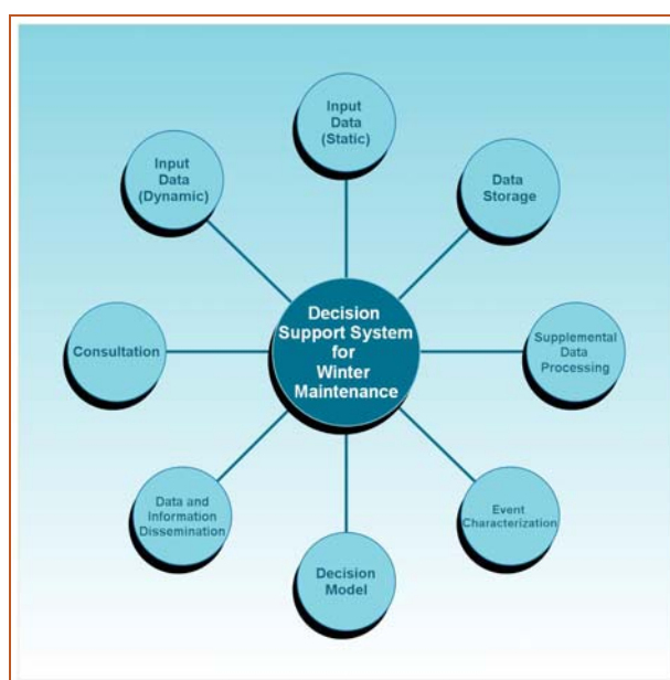
Fig. 1. Diagram of essential elements for a winter maintenance decision support system.

While most DSSs may contain some or all of these higher-level components, not all applications will deliver the required level of performance, as the specific approaches employed within each discrete component are what dictate a DSS's ability to meet and/or exceed the expectations of the end user. The following sections describe in more detail the required attributes that are necessary for the successful development and deployment of a winter maintenance DSS. Due to manuscript limitations, the primary focus of this discussion is on data inputs and data dissemination. In no way is this to detract from the importance of the other elements found in Fig. 1, since all are critical in the development and deployment of robust, operative winter maintenance DSS applications.