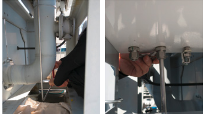
Connect the oil inlet and outlet lines