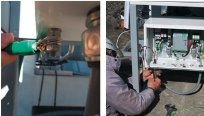
Connect the grounding, DC cable, AC power, and ethernet to a PC