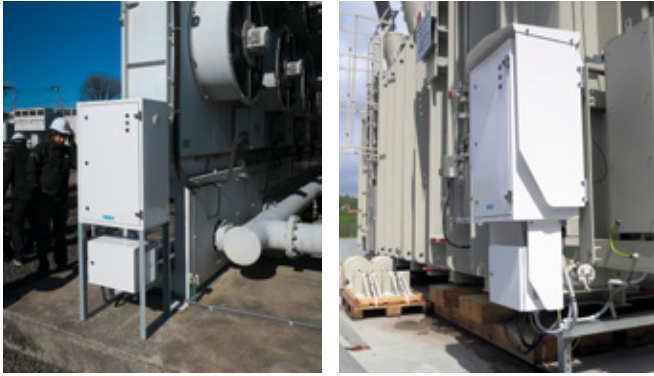
Mount on the ground or transformer