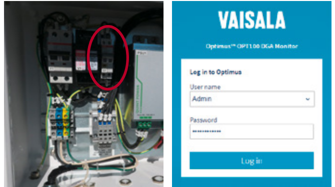
Follow the simple onscreen instructions