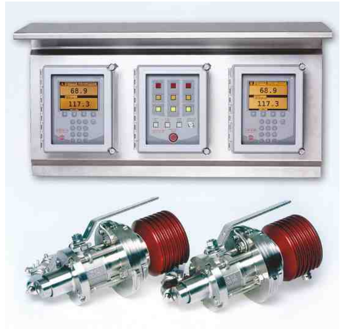
Figure 3. Vaisala K-PATENTS Digital Divert Control System DD-23.