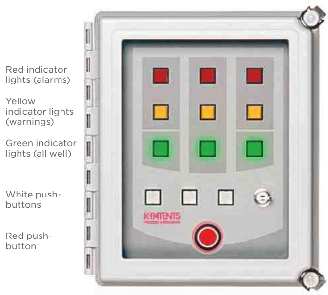
Figure 2. Vaisala K-PATENTS DD-23 Operator panel.

The indicator lights on the operator panel are arranged like traffic lights: top row is red for alarm, middle row is yellow for warning and bottom row is green for "system ok". When the system is running normally, only the row of green lights should be lit.